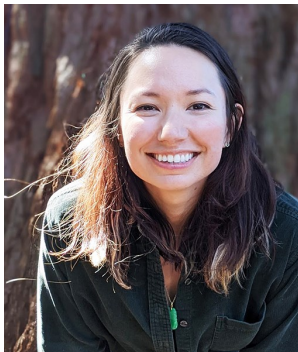
Biography credit: tracysubisak.com/about